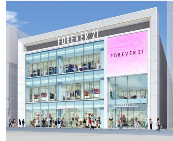
Design image of Dotonbori ZERO GATE*