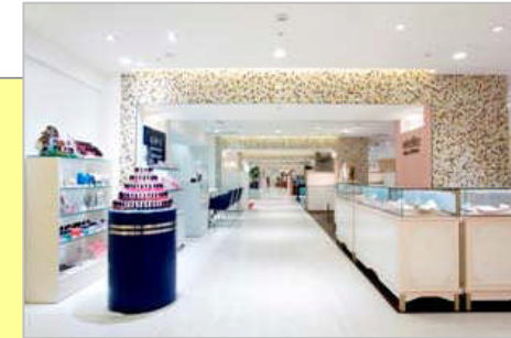
A common area with a combination of LED and existing high-efficiency lighting

Expand introduction rate of LED in Kanto area PARCO stores from 25% to 50% and reduce annual energy consumption by lighting equipment by 60%.