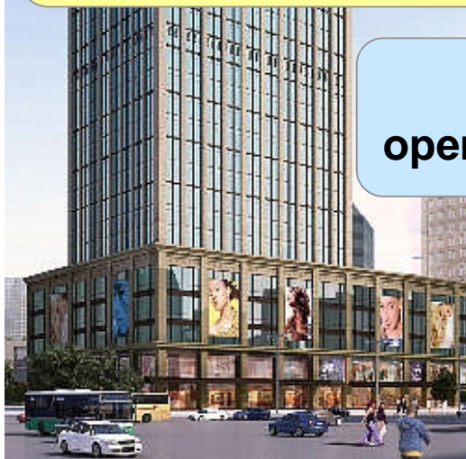
Design image of full view of Nison Plaza Project. Commercial facilities are on lower section.

Briefing meeting to be held in September for enterprises considering opening in the property. Business planned to begin in spring 2013.