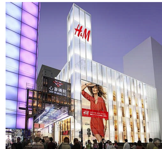
Design image of Shinsaibashi ZERO GATE*