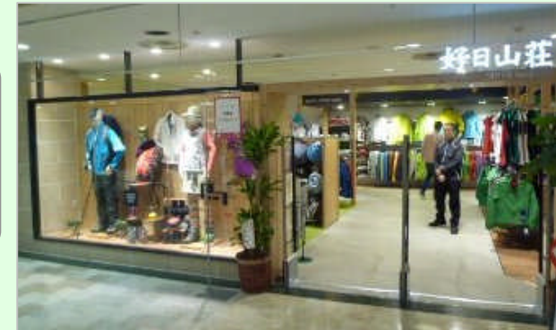
(Example image of completed store)

In order to respond to a wide range of clientele from a wide area, reconfigure interior and general goods floor and combine with newly introduced large-scale outdoor specialist stores to strengthen ability to attract customers.