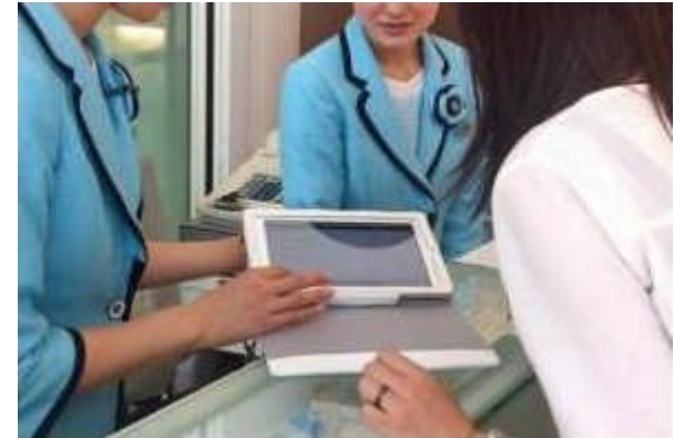
Giving information using a tablet device with application for English, Chinese and Korean support

Introduced translation applications for tablet devices at PARCO stores with high numbers of foreign customers. Looking at the results, we now plan to sell externally.