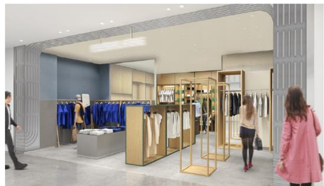
Shop image of PORT PARCO