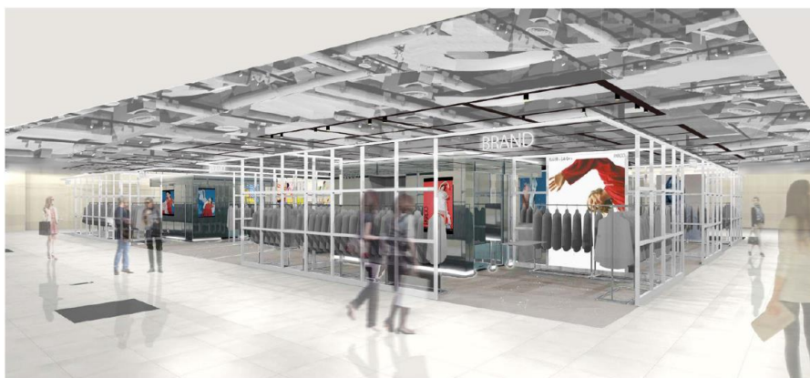
Shop image of CUBE

The space is arranged so that consumers can engage in stress free shopping by sending data directly to their portable device using large signage in common areas, or signage within specific stores, and so allowing them to buy goods not available in stores at any time online.