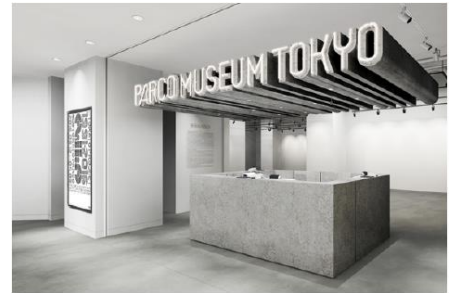
PARCO MUSEUM TOKYO