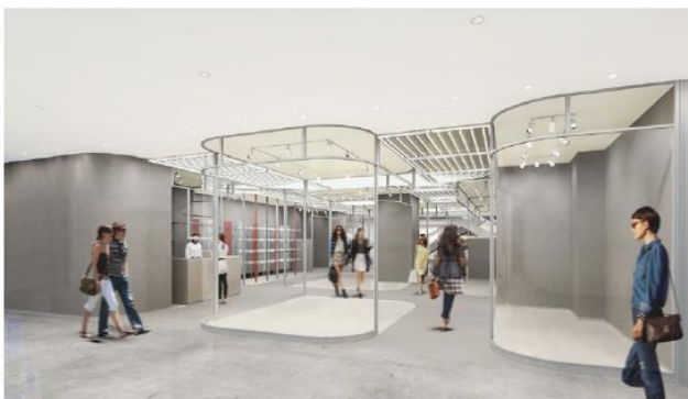
Shop image of GEYSER PARCO