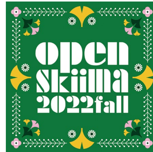
In November 2022, PARCO held a one-day-only market event, OPEN SkiiMa, for the general public at SkiiMa, which can normally only be accessed by SkiiMa users. The event included a silk screening workshop, art exhibition, food and beverage sales, and more.

At SkiiMa, PARCO conducts a large number of projects that include collaborations between individuals and companies contracted to use the space and also local projects that originate at the store. In fiscal 2022, around 20 art projects were held, including workshops, talks, exhibitions, solo shows and markets, at SkiiMa SHINSAIBASHI in Shinsaibashi PARCO and SkiiMa KICHIJOJI in Kichijoji PARCO on a combined basis. Through “Likes,” SkiiMa supports up-and-coming talent in rising to the challenge of excelling on the global stage and supports the realization of a society where individuals with talent and ideas can continue to take on challenges.