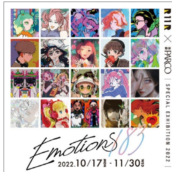
Ikebukuro PARCO project in collaboration with the creative studio R11R

PARCO started a demonstration experiment in March 2022 on the utilization of NFTs linked to store projects and events with a view to providing experiential value that links the NFTs with the real space of PARCO stores. In fiscal 2022, ten projects were conducted at PARCO stores in Shibuya, Ikebukuro, Sapporo, Sendai and Shinsaibashi. PARCO held the project throughout Ikebukuro PARCO, which involved distributing NFTs to people interested and holding a signing event with creators that was open to customers with an NFT as a gift to them. Utilizing NFTs increased engagement between creators and fans at a real location and also served to communicate information about the store. In fiscal 2023, we will continue to verify the use of NFTs as a way to connect customers with PARCO stores.