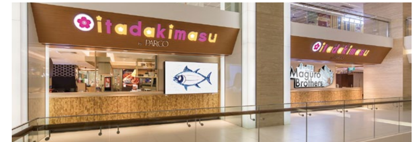
itadakimasu by PARCO (Singapore)

PARCO (Singapore) developed itadakimasu by PARCO, a Japanese food and beverage zone at 100am, a local commercial facility, and it achieved record-high annual sales in fiscal 2022. In addition, in November 2022 it signed a new joint project contract with Tan Chong International Ltd. that is primarily for deployment of food and beverage zones. Moreover, from May to June 2022 it held DreamWorks Animation's Trolls—A Tea Experience at Anti:dote with a hotel managed by RC Hotels in Singapore. In this way, the company has steadily built up a track record locally in the food-related business.