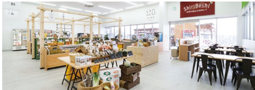
Northern Store SHIRIBESHI-YA

PARCO SPACE SYSTEMS provided rebranding support for Northern Store SHIRIBESHI-YA, a direct-to-market store that was updated in December 2022. Conducting rebranding with the operator, who was also the client, and a local production and consulting company, PARCO SPACE SYSTEMS provided comprehensive support, handling everything from interior design and construction to concept creation, naming and logo design, creation of graphics and a brand story, shopping tool design, visual merchandising support and customer service training. As a hub for communicating the appeal of the Shiribeshi region of Hokkaido, the aim was to create a store that would contribute to the community and help energize the local economy.